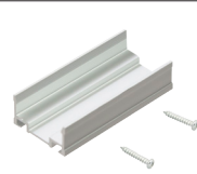
Mounting Clips (10) Aluminum clips with (20) screws RGB-H2-CLIPS-AL