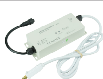
RF Receiver (For RF Control) Non-rated; Requires Trulux RF Controller with RGB-H2-CTRL RGB-H2-REC-RF