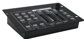
3-Channel DMX Controller 5ft 120V AC power cord plus adapter Nine color presets DMX-RGB-3