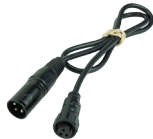
XLR3 Adapter Auxiliary DMX controller cable for RGB-H2-CTRL RGB-H2-XLR3-PT