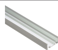
Mounting Channel Aluminum RGB-H2-CHAN-3 (3ft)