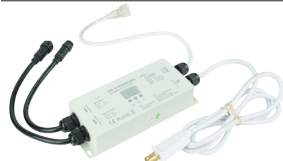
Standalone Controller (Required for operation) Non-rated; IP67; Also required for DMX 512 operation RGB-H2-CTRL