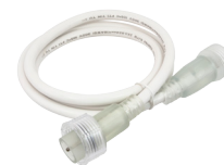
Twist-on Linking Cables Interconnectable between lighted sections RGB-H2-EXT-JUMP.5 (6") RGB-H2-EXT-JUMP3 (3ft) RGB-H2-EXT-JUMP10 (10ft) RGB-H2-EXT-JUMP20 (20ft)