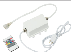
IR Controller (120V / Up to 150ft) cETLus Listed, Indoor/Outdoor; Incl. remote and 5ft power cord RGB-H2-IR-5A