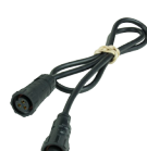
Signal Linking Cable Interconnectable Link multiple RGB-H2-CTRL units RGB-H2-CTRL-EC15 (15ft)